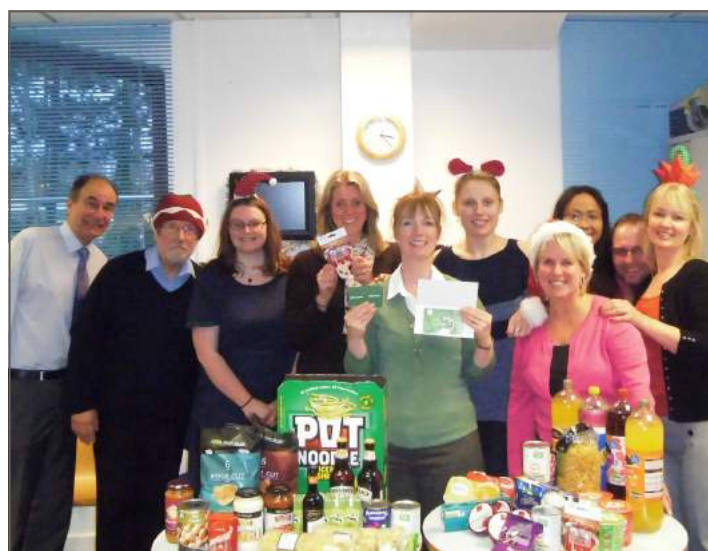
Head Office Christmas food parcel collection for a group of people we support in Bicester

The Parents and Families Questionnaire results were collated in December and showed that 97% of parents and families would rate our services as good or excellent.